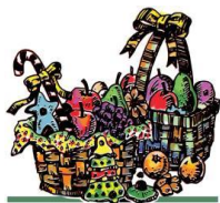
In the Hospital

Normal hours are 9 to 2 Mon. – Fri. If you need any help from the office i.e., copying documents, record information, info to be put in the bulletin and/or newsletter, etc., please feel free to stop by, call, etc. We are there to provide you with whatever you need from the church office. You may also leave a note in the Secretary's box in the Narthex, and we will get back with you as soon as possible. Please let us know if you have any questions or suggestions.