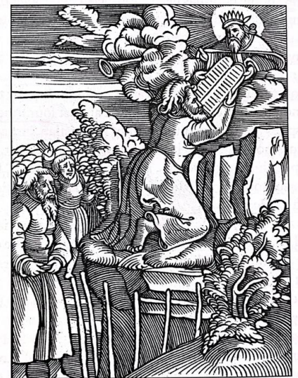
GIVING OF THE COMMANDMENTS (EXODUS 19)