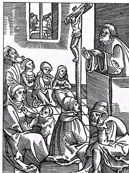
HEARING AND DESPISING PREACHING AND HIS WORD (NUMBERS 15)