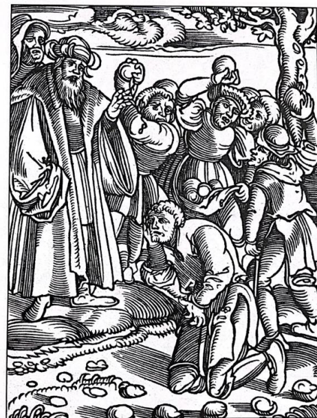
THE SON OF SHELOMITH IS STONED FOR BLASPHEMY (LEVITICUS 24)