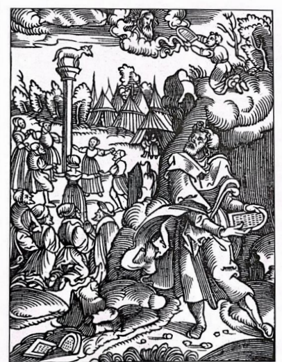
WORSHIP OF THE GOLDEN CALF (EXODUS 32)