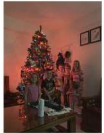
The best fake Christmas tree — with snow — ever!