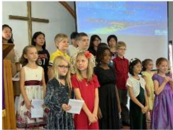
The children sang together in the choir for the Christmas program.