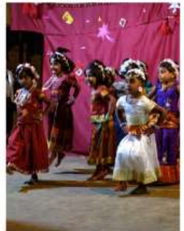
Above Right: The cultural program in Westward Ho.