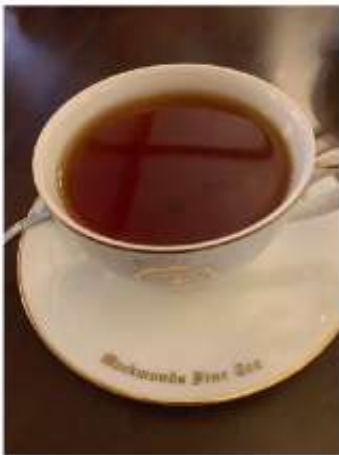
Above Left: the best tea in the world: Mackwoods in Sri Lanka.