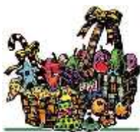
In the Hospital

May God bless you and keep you always in His tender, loving care