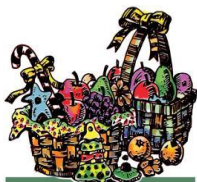
In the Hospital

Normal hours are 9 to 2 Mon. – Fri. If you need any help from the office i.e., copying documents, record information, info to be put in the bulletin and/or newsletter, etc., please feel free to stop by, call, etc. We are there to provide you with whatever you need from the church office. You may also leave a note in the Secretary's box in the Narthex, and we will get back with you as soon as possible. Please let us know if you have any questions or suggestions.